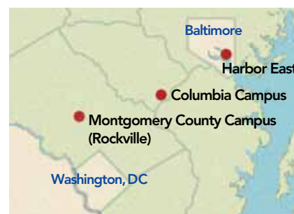
Three strategic locations in the Baltimore-Washington, DC corridor

The Carey Business School offers a range of financial aid options, including federally subsidized loans, state aid, and several institutional grants and scholarships. Grants and scholarships are generally based on financial need and are competitive. All financial aid applicants, including those applying for scholarships, must submit a FAFSA and Institutional Financial Aid Application. Scholarship applicants must also submit the Carey scholarship application. More information on financial aid is available at carey.jhu.edu/financial_aid .